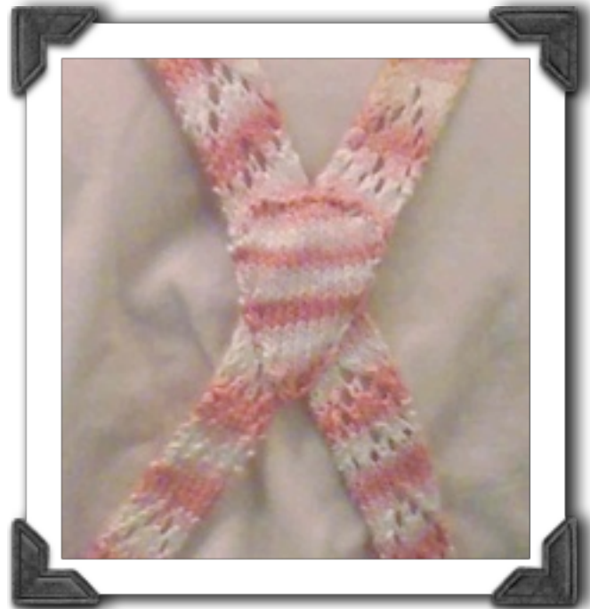
Close up of Back Cross-Piece Detail

While wearing the straps and with the aid of a mirror or friend, pin the straps in the center of where they cross in back. This should leave approximately one-fourth of the strap below the center point. Sew the Back cross-piece over the straps, making sure to secure both straps to the edge of the cross-piece.